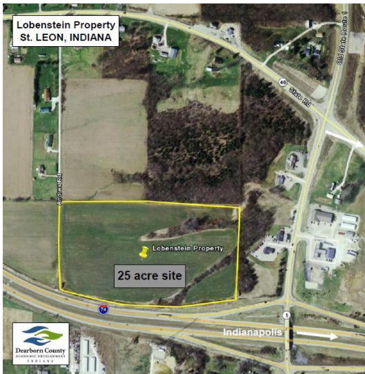
See page 3 for larger photo